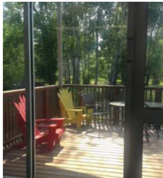
Outdoor reading area at Bibliotheque Allard Regional Library.

Visit their website www.allardlibrary.com