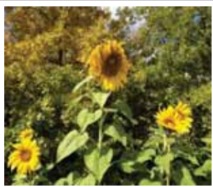
Art can grow like sunflowers!