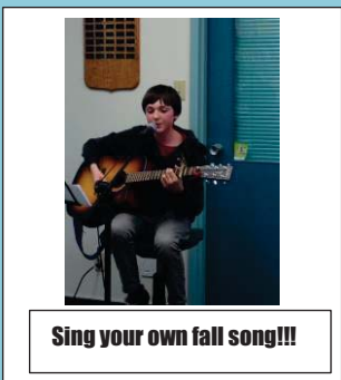
Sing your own fall song!!!