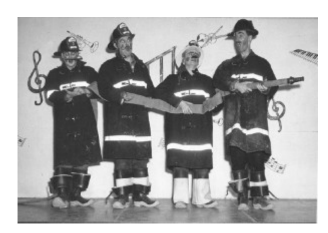
"The Volunteer Fire Brigade" Men's Barbershop Quartet

For 51 years, the Pinawa Players have presented over 100 plays including comedies, dramas, musicals, dinner theatre, and children's shows. They usually stage two