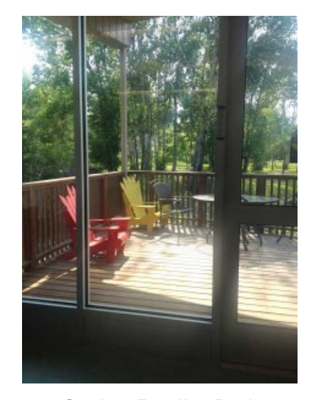
Outdoor Reading Deck

Library Allard is also the administrative centre for Victoria Beach Branch which opened in November, 2009. The two libraries serve RM of Alexander, Town of Powerview-Pine Falls and RM of Victoria Beach. Library Allard also provides open shelf service to Manigotagan, Bissett, and Seymourville so people in these communities can receive books in the mail and access the library's catalogue.