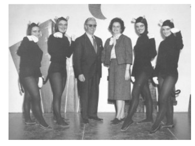
Pinawa Players Production 1964 "The Alley Cats

In the early 1960s, AECL expanded its operations to Manitoba, and created the town of Pinawa. Most of the employees came from Ontario, with many of them already active in the "Deep River Players."