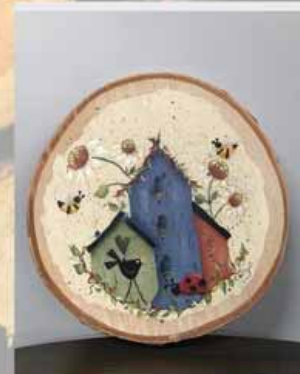
Folk Art Birdhouses by Cathy Gregg