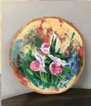
Showy Lady Slippers